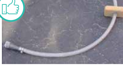
Hose has no kinks and includes a sponge to reduce leakage at penetration when insulating.