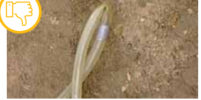
Hose has major kink.