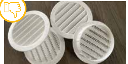
Vented plugs for insulation access holes.