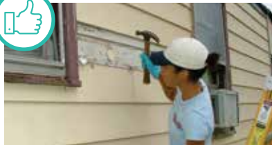
Insulation access holes plugged and sealed with solid plugs.