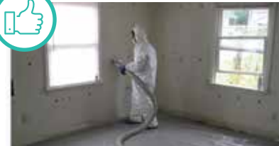
Insulating brick or stucco wall from interior.