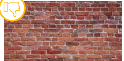
Brick wall to be insulated from exterior.